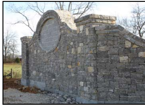
Williams Park entrance construction

Wade's Grove — JMB's all-brick community development continues to rapidly expand. We will soon complete construction on all of our 82 single-family units in Section 1. And a large portion of new home construction in Section 3 is underway where we have a total of 96 lots for single-family homes. Section 4, which consists of 82 more lots is being prepared for construction. By the time